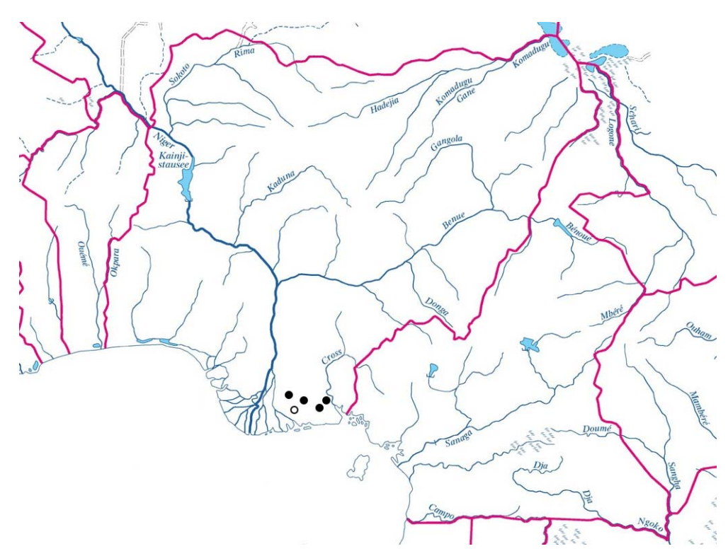
FIGURE 4. Distribution map for P. sacrimontis , based on collection data of neotype and paraneotypes; unfilled dot = type locality for neotype.

Thys van den Audenaerde (1968) also wrote that his P. pulcher B was a distinct species and had often occurred in the aquarium trade as " Pelmatochromis camerunensis ", however, a valid description with use of this name had not been published. In subsequent years, the proper use of names for P. aff. pulcher was rare. Very often it has been imported as Pelvicachromis pulcher "Red", also in scientific collections it has been mostly labelled as P. pulcher or P. aff. pulcher (pers. obs.).