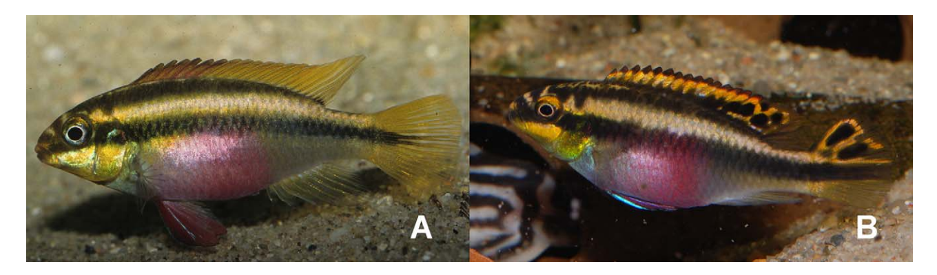
FIGURE 3. Comparison of coloration of females: A. female of P. sacrimontis in aquarium, Nigeria, Rivers state, SL 45 mm, not preserved; B. female of P. pulcher selected from a commercial import from Nigeria, not measured, not preserved.

Description. Measurements and counts for neotype and 29 paraneotypes are given in Table 1. Sexual dimorphism and dichromatism well developed. First ray of pelvic fin always longest in males, tip of pelvic fin reaching anterior base of anal fin or beyond. In females, first ray of the pelvic fin shorter or of equal length to second ray. Caudal fin rounded in both sexes. Some rays in posterior parts of dorsal and anal fins pronounced, but always much longer in males. Adult males usually 15–25% larger in TL than females.