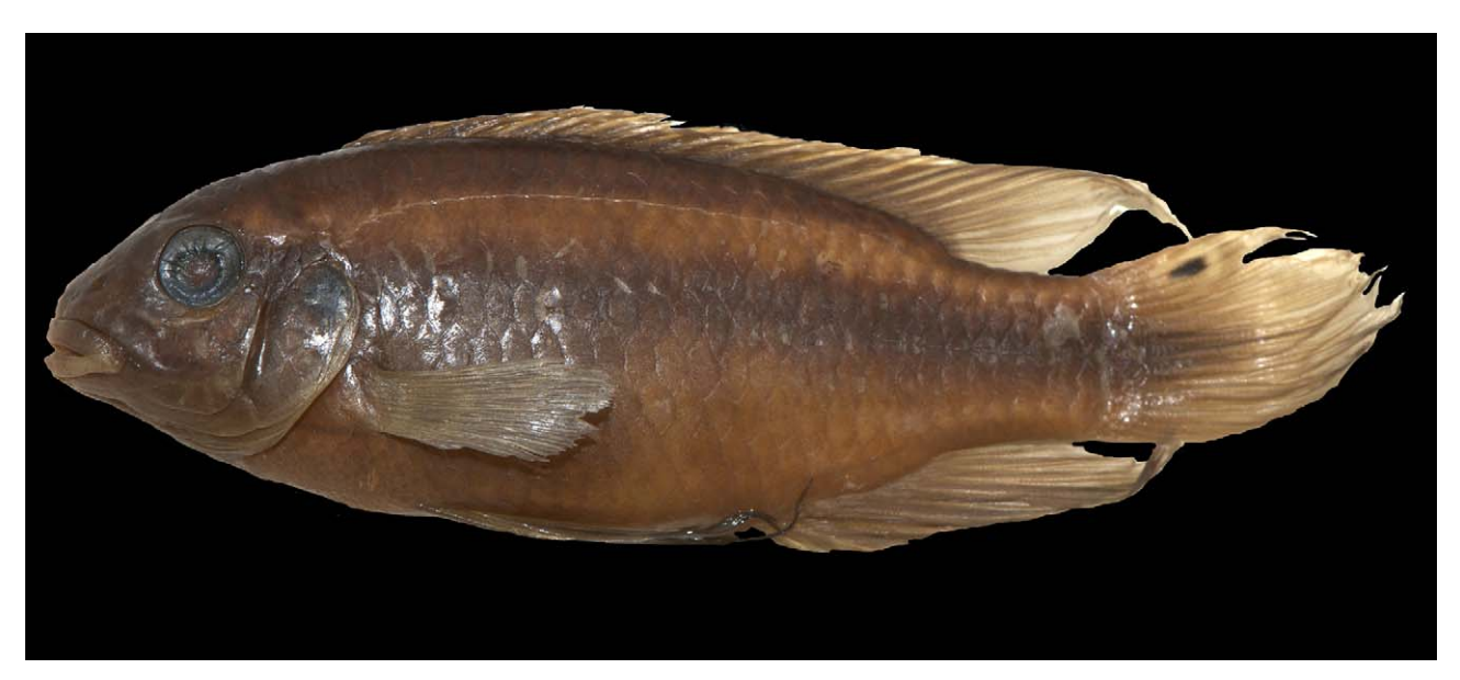
FIGURE 1 , Neotype of Pelvicachromis sacrimontis , MRAC 86-10-P-102, male, 66.4 mm SL, Nigeria: Chokoche, Imo River, Rivers State, Niger River system, 4° 59' N, 7° 59' E, Collected by P.J. Akiri, August 1985.

Diagnosis. A species of Pelvicachromis , distinguished from all congeners by a combination of characters as follows: Differs from Pelvicachromis taeniatus (Boulenger, 1901) and Pelvicachromis subocellatus (Guenther, 1871) in absence of a pattern of pale blue and reddish dots on the caudal fin of adult males. Differs from Pelvicachromis roloffi (Thys van den Audenaerde, 1968) in a broader midlateral band on the body, absence of small dots in the male caudal fin, absence of red margin with whitish to bluish submargin in the female dorsal fin. Differs from Pelvicachromis humilis (Boulenger, 1916), Pelvicachromis rubrolabiatus Lamboj, 2004 and Pelvicachromis signatus Lamboj, 2004 in absence of dark vertical bars on body. Differs from Pelvicachromis pulcher in a broader midlateral band on the body, usually as broad or broader than a pale yellowish band dorsal to this dark band, iridescent blueish to turquoise coloration band on cheeks and a different coloration of the dorsal fin in females (no margin, spiny portion pale to dark and dusky orange, soft parts yellowish to clear in most posterior regions vs. black margin, yellow submargin and black fin base in P. pulcher ).