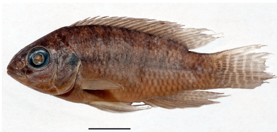
Figure 1. - Pelvicachromis silviae , NMW 95243, male, 47.8 mm SL; Nigeria, Niger River system, river Uwerum, near village of Ughelli, app. 5°30'N-5°59'E, Delta State, coll. E. Ajih, Feb. 2009. Scale bar = 10 mm.

Figure 2 (right). - Coloration patterns of P. silviae for both sexes in different behavioural situations, in comparison with P. subocellatus from Lower Congo, Moanda region. All specimens imported for ornamental fish trade, not preserved, not measured. A: Female of P. silviae ; B: Female of P. subocellatus , both in normal coloration, possessing the two lateral bands; C: Female of P. silviae ; D: Female of P. subocellatus in normal coloration without lateral bands; E: Female of P. silviae ; F: Female of P. subocellatus in courting display; G: Male of P. silviae ; H: Male of P. subocellatus ; I: Male of P. silviae guarding fry, notice the pattern of diffuse vertical bars from dorsum to mid-body; J: Juveniles of P. silvae with an age of about 2 weeks, before getting adult coloration.